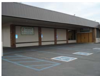
Above: Main Entrance Top Right: Sanctuary at Christ Our Savior Bottom Right: Fellowship Hall.

Please send us a quick note if you are willing to HELP OUT by donating your time, resources or talent and keep you eyes out for future announcements of opportunities to volunteer.